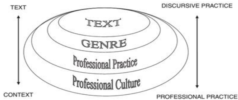
Figure 1. Levels of Genre Realization (Bhatia, 2010, p. 34)

Nevertheless, Bhatia (2010) argues about a multi-perspective model to genre analysis which underscores the role played by context. To this end, he considers "three levels of realizations as textual, genre-specific, professional practice, and professional culture" (Bhatia, 2010, p. 33) as the following diagram (Figure 1) illustrates: